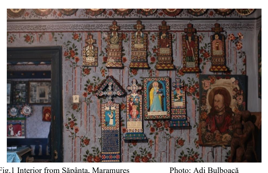
Fig.1 Interior from Săpânța, Maramureș

In order to stay relevant to the contemporary world and newer generations, these heritage elements should adapt, or be adapted into new projects that are presented to the world. Local crafts and communities have to be integrated within contemporary creations. as well as discussed and presented to the world. This will not only provide awareness, but also exposure, attracting more lucrative opportunities and sustained development.