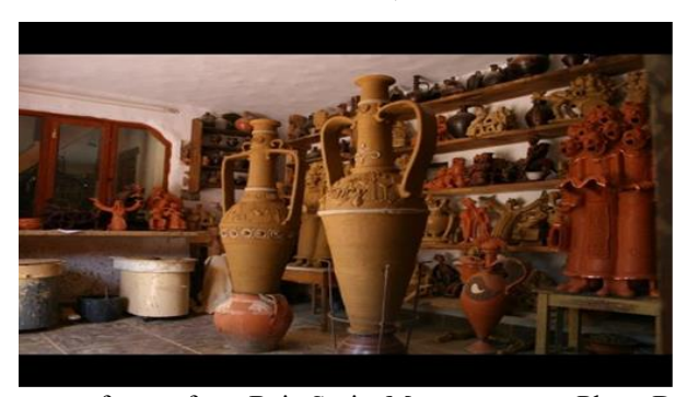
Fig. 8 Pottery craftsmen from Baia Sprie, Maramureș