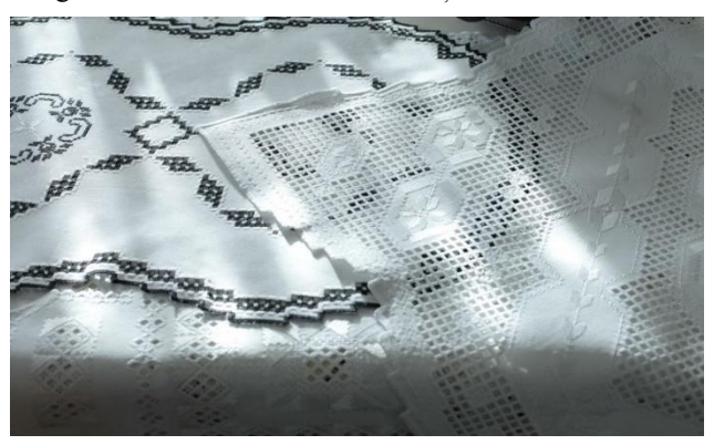
Fig. 12 Craftsmen from Maramures

This says a lot about ,,the relationship between the people and theirs costumes. Romanians are conscious about the beauty and value of their costume, through which they see the legacy of their bright tradition. Hence, they wear it with an unequalled spiritual pride and visible body delight. The Romanian folk costume is the external, plastic and eloquent sign of the consciousness, the same on the entire Romanian territory, somehow overlapping and identifying itself with the language of the Romanian people. This seems to be the private signification of the deep,