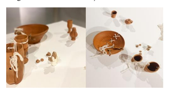
Fig. 29 - 30