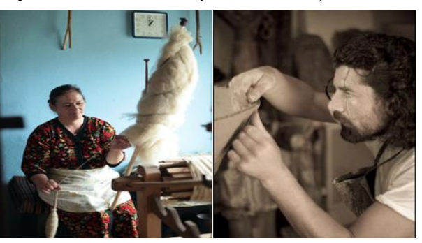
Fig. 9 Photo Adi Bulboacă Fig. 10 Photo Daniel Leș