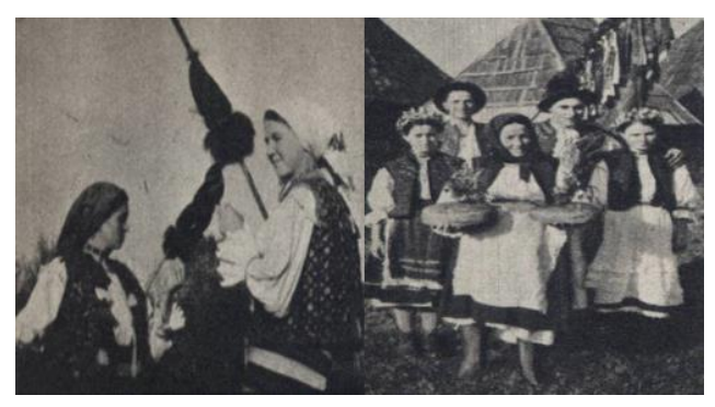
Fig. 16 - 17 From Bănățeanu, Tancred, Traditional costume from Maramureș. Ethnical areas Oaș, Maramureș, Lăpuș

They protect their legs with woolen socks over which they put on "opinci", and in winter black leather high boots."<sup>29</sup>