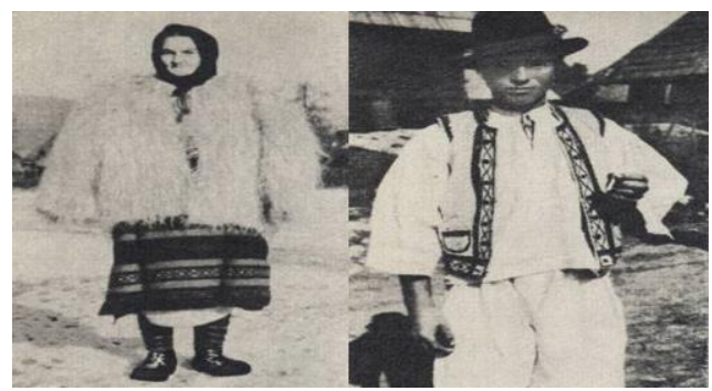
Fig. 20 – 21 From Bănățeanu, Tancred, Traditional costume from Maramureș