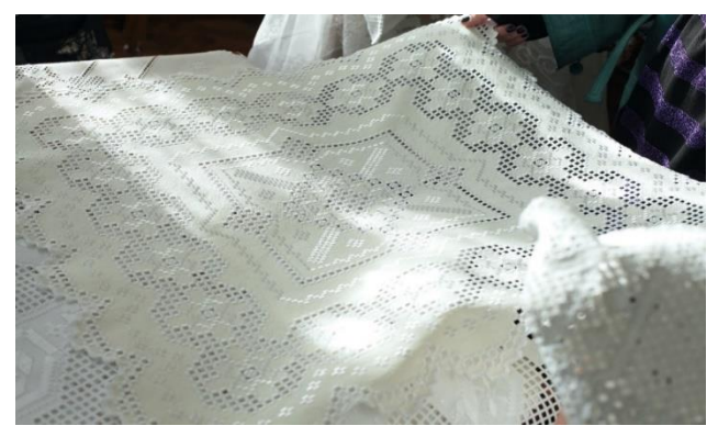
Fig. 11 Craftsmen from Maramures