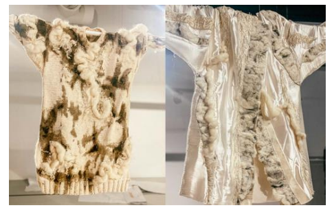
Fig. 31 - 32