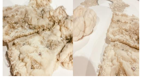
Fig. 27 – 28