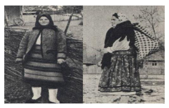
Fig. 18 - 19 From Bănățeanu, Tancred, Traditional costume from Maramureș. Ethnical areas Oaș, Maramureș, Lăpuș