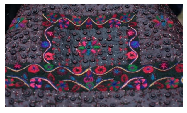
Fig. 7 Craftsmen from Maramureș