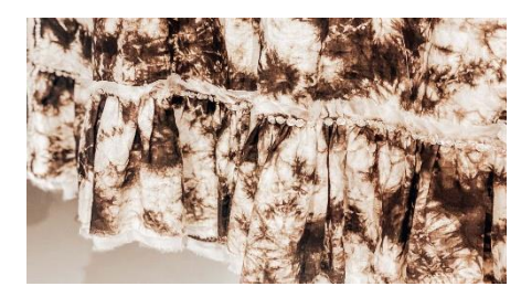
Fig. 23 – 24