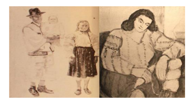
Fig. 13 Ion Grigorescu – "Vadul Izei", 1981 Fig. 14 Theodor Pallady - "The peasant"

"The structure of the Romanian costume in the Maramureş region preserves lots of archaic elements, among which the "gubă" (made of tufted white, grey or black wool, an integral piece of winter costume due to the long cold winters in these areas) and the woolen" zadii" (striped aprons made of a single width of woven wool).