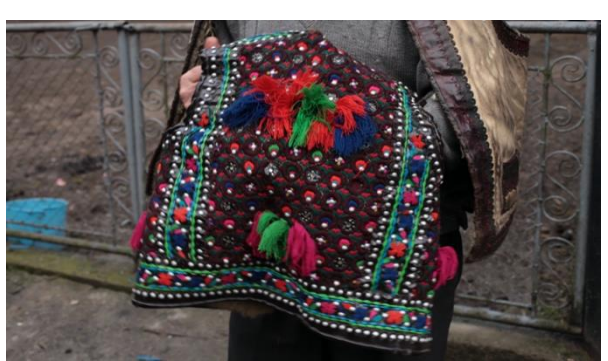
Fig. 4 Craftsmen from Maramureș