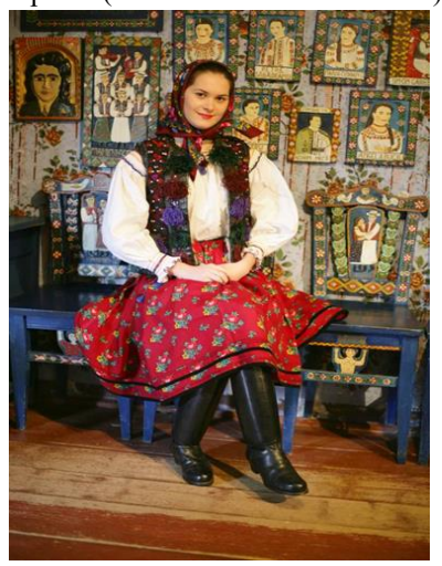
Fig. 15. Traditional women's costume from Săpânța

Girls braid their hair into "pleteri" by the temples and into pigtails hanging down the neck. On holidays they put flower coronets on their head. Wives braid their hair into pigtails tied on the top "steble" and cover their head with a homespun kerchief "pânzătură" or with a floral cashmere kerchief bought in town. They put on wool knit socks and then "opinci" (traditional leather footwear).