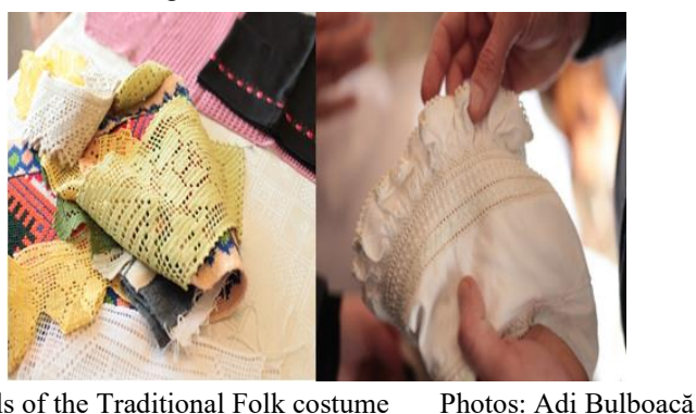
Fig. 2 - 3 Details of the Traditional Folk costume

initially, its function was only practical, the purpose being to protect the body against weather and to serve to the ordinary; only afterwards it attained an important artistic side, a result of long research, of its ephemerality. In time it morphed into intricate objects of artistic craftsmanship.