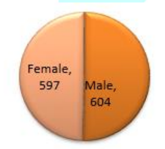
Figure 1- Gender Based Population

According to the population of the research, there are 404 families in the Bellankadawala village. It is consisted 604 males and 597 females and the total population is 1201. Most of the villagers are Sinhala Buddhist and there are only 3 Tamil women in the village.